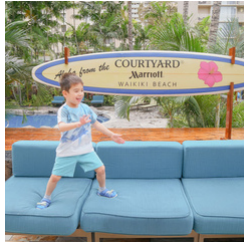
Waikiki Courtyard Marriott