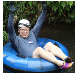
Kauai Backcountry Outfitters