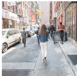
Real New York Tours