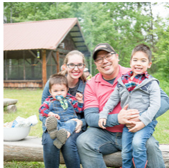
Sun Mountain Lodge