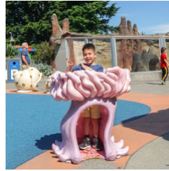
Travel Tacoma + Pierce County