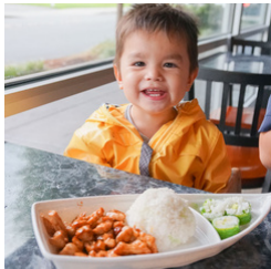
Visit Kent WA