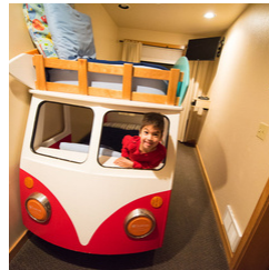
Inn at Cape Kiwanda