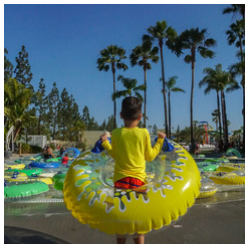
Visit Buena Park